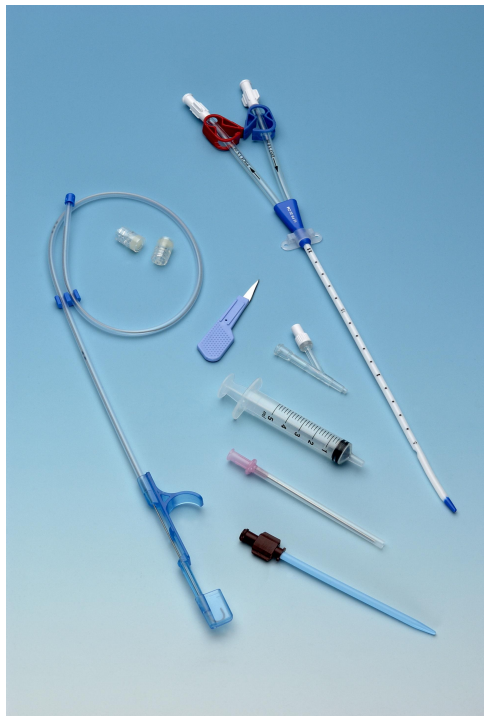
Figure 2. Typical contents of a dual lumen venous catheter insertion pack

Good flow through the intravenous catheter is crucial to prevent stasis of blood in the circuit and clotting of the filter. There are a number of things to take into account when choosing the site of the vascular access. [Please see Table 3]