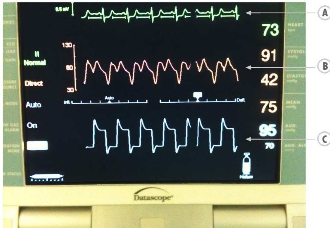
Figure 2. Datascope® IABP display unit during ECG triggered 1:1 augmentation.

es a sharp upstroke on the arterial pressure waveform followed by a tall peak which represents the assisted diastolic pressure. Deflation occurs at the onset of systole immediately before opening of the aortic valve. This corresponds with the peak of the R wave on the ECG trace and the point just before the upstroke of systole on the arterial pressure trace. As the balloon deflates, the assisted aortic end-diastolic pressure dips down to create the second deep wave, usually U shaped on the arterial pressure waveform. IABP timing in relation to the cardiac cycle is monitored by display of arterial pressure waveform, the ECG trace and an intra-balloon pressure trace as shown in Figures 2 and 3 .