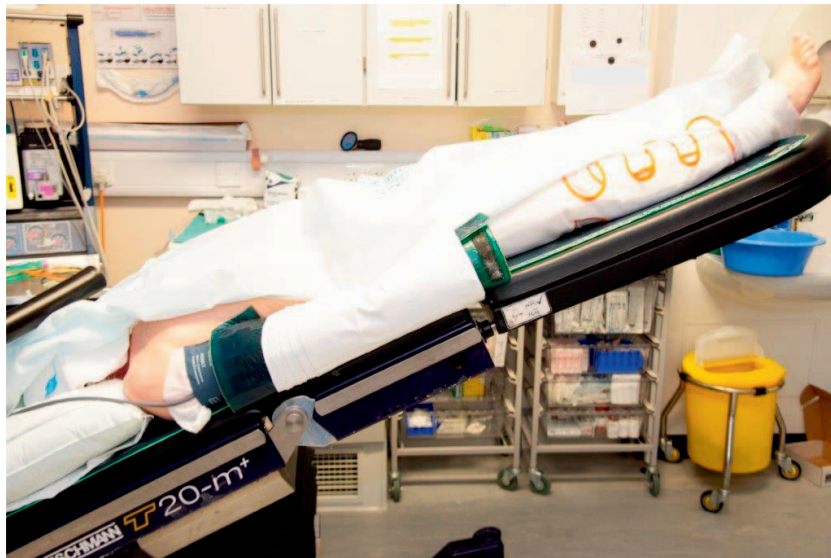
Figure 2. Patient positioned in steep Trendelenburg position within the anaesthetic room prior to transferring to the theatre. Pressure areas are padded and arms are wrapped with lines outside the padding to prevent sores.

Patient arms should be wrapped snugly to their sides, ensuring that all lines are first padded to prevent pressure injuries. Patients should be placed on a nonslip mat to prevent them sliding down the table during the procedure. Shoulder brace and straps may be required. Antiembolic stockings and intermittent pneumatic compression should be used intraoperatively to prevent deep vein thrombosis. A forced-air warming blanket should be applied.