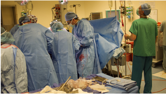
Figure 5 – NATO surgical team in action at a Role 3 medical facility in Afghanistan