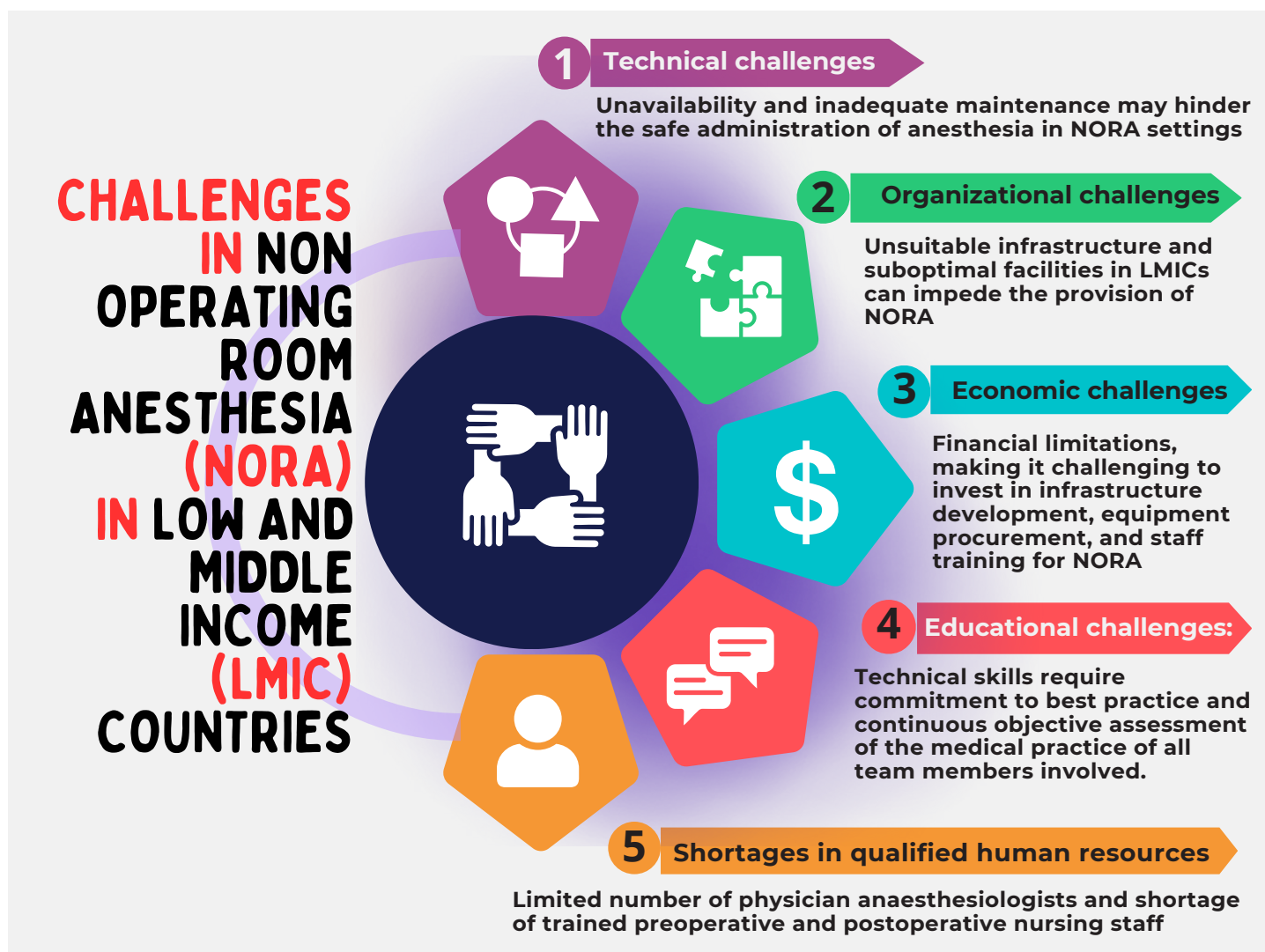
Figure 1 – Critical dimensions to address safety in Non-Operating Room Anesthesia (NORA) in Low-and Middle-Income Countries (LMICs).

Certain anaesthetic techniques, such as regional anaesthesia and sedation, are well-suited for NORA. 24 However, skill gaps and limited training opportunities in these techniques may pose a significant challenge. 25 Strengthening training programmes, promoting knowledge exchange through partnerships, and utilizing simulation-based education can enhance anaesthesia providers' skills and increase the adoption of appropriate techniques. 24