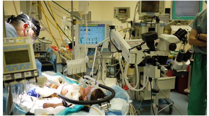
Figure 4 – Paediatric surgery in progress at a Role 3 NATO medical facility in Afghanistan

In the conflict setting there are considerable issues with access to compressed gases, including oxygen, such as the weight of cannisters and the inherent risk of carriage and storage of such gases in an area prone to the use of high and low explosive ordinance. Therefore, oxygen concentrators are preferred. However, these require electricity to function and deliver oxygen at just over one bar (not sufficient for Boyles type anaesthetic machines). Draw-over can be advantageous in this context: this continues to work in the absence of electricity, economical oxygen consumption (1L/min-1 = FiO 2 of 0.3), it is not possible to give a hypoxic mixture so inspired O 2 monitor is less vital, and they are non-rebreathing circuits so agent monitoring is