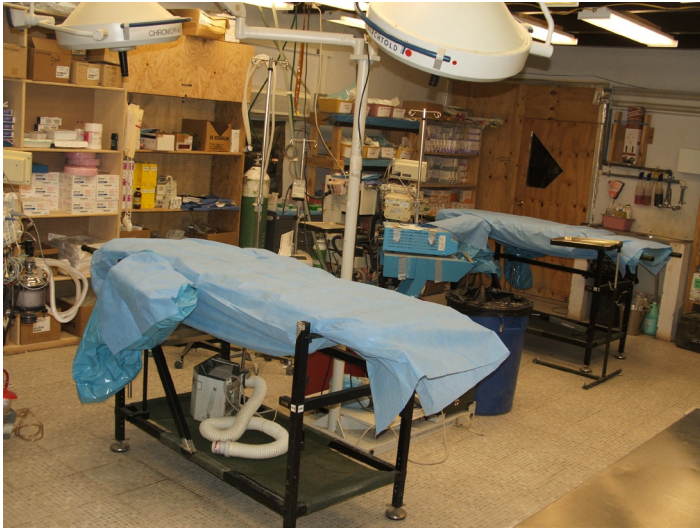
Figure 1 – Dual-operating tables at a US Forward Surgical Team (FST) in Afghanistan c. 2010

it was formulated in 4.5% and 25% solutions. Whole blood was also used.