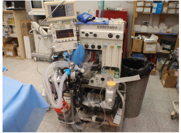
Figure 2 – Narkomed anaesthesia unit at a US FST facility in Afghanistan c. 2010

Humanitarian NGOs and foreign press alike have reported at least 226 direct and indirect attacks by Russian military on Ukrainian health facilities to date with the maternity hospital in Mariupol being most widely publicised amongst the international media. 8 This demonstrates a specific targeted approach towards health