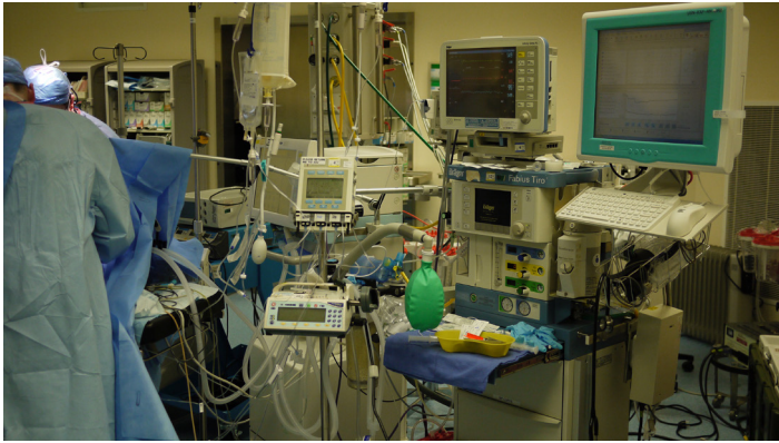
Figure 3 – Operating room with Dräger anaesthesia machine at a Role 3 NATO medical facility in Afghanistan

capacities, triage must be implemented. Triage in armed conflicts and disasters differs considerably from triage used in routine settings: with the main goal being to provide the best possible surgical care to the highest number of casualties, with limited resources. When working in this context it is important to accept there are limits inherent to surgical care, while always upholding the principles of medical ethics. 8 Anaesthetists must be prepared to take on a number of secondary tasks for which they have little or no experience, including but not limited to: pharmacy skills; infection control and sterilisation, and laboratory pathology and interpretation.