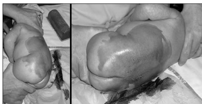
Figure 1. Lateral position to perform SA in 4kg newborn

Lumbar puncture is performed at L3-L4 or L4-L5 level. Various sizes and lengths of needles are available depending on the child's age. We use a 25G or 26G needle with stylet for neonates and infants (Figure 2). Using a needle without a stylet is not recommended since epithelial tissue can be deposited in the intrathecal space and may cause dermoid tumours of the neural axis.