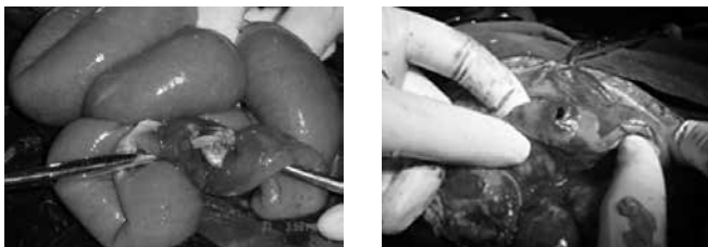
Figure 2. Perforations on the anti-mesenteric border of the terminal ileum (photographs supplied by Professor Emmanuel Ameh, Paediatric surgeon, National Hospital, Abuja, Nigeria).

Typhoid perforation is the most serious complication of typhoid fever and children account for a larger proportion of cases. It typically presents with gastrointestinal symptoms though presentation may be atypical in infants or toddlers. Aggressive resuscitation and antibiotic therapy must be commenced before surgical intervention to reduce mortality. Anaesthetic management is of a critically ill child with a full stomach. Postoperative care is key to recovery in these patients and may need to be done in the HDU/ICU.